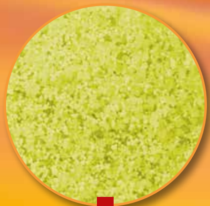
Yellow in contact with acids