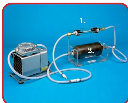
800-ONEG Oxygen Removal System

#800-DESI includes three (3) canisters filled with Molecular Sieve™ and hoses with quick disconnects. Pump not included.