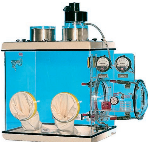
800-HEPA/D. Open exhaust (double) HEPA filtration system.

#800-CARBON/C Replacement Carbon Filter (8"Ø) (203 mm) diameter. One (1) per package. Non-Impregnated Carbon Filter for absorption of aromatic hydrocarbons, organic vapors, keytones, alcohols, organic acids, esters, Nitrogen compounds, and odors.