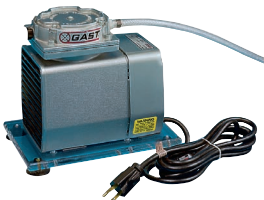
800-PUMP, Vacuum Pump

Includes an in-line on/off switch and five (5) feet of flexible hose. No quick disconnects.