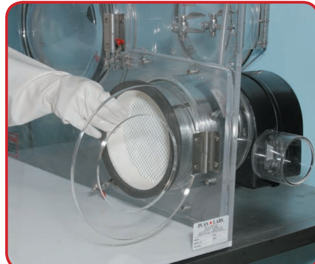
800-HEPA/S with filter access door open. Internal view (when changing filters)

#MF-50/9 Spun Polypropylene Pre-filter Pad , 8"Ø (203mm Ø) diameter. Color white, point four (.4 µ) microns. Twelve (12) per package.