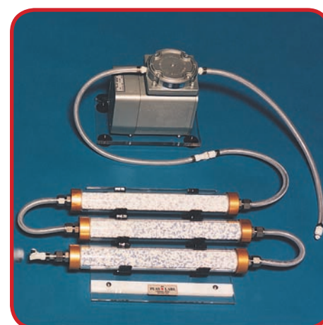
800-DT Drying Train System with Pump

The heater draws the internal atmosphere off the floor and pushes it up across heating elements and Palladium pellets. Any trace amounts of Oxygen are then reduced into water (H 2 O) vapor. The Drying Train #800-DT (see below) then removes the vapor as needed.