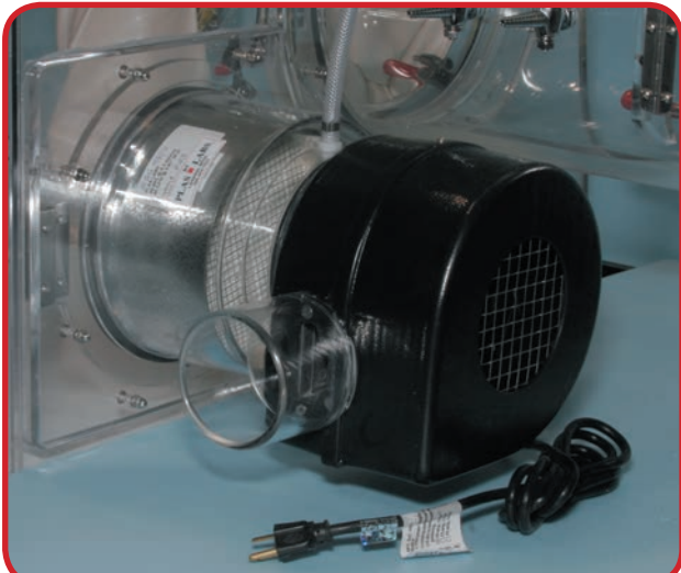
800-HEPA/S (External view with exhaust outlet connector.)

Additional Filtration components (not shown).