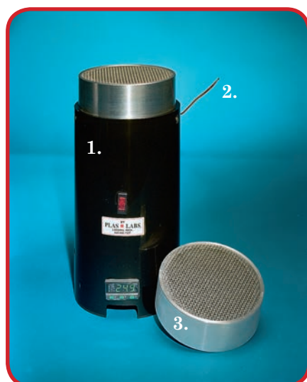
800-HEATER & 800-PC